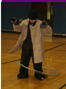
This little dresses BIG while setting his sights on conquering the obstacle course at the Winter Blast.

" Our vision consists of successful mentoring relationships for all children who need and want them contributing to better schools, brighter futures, and stronger communities for all."